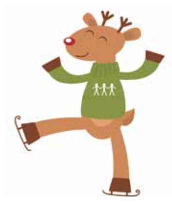
http://www.amherst.ny.us/pdf/ trackus/attachments/January%20 2019%20front%20PDF.pdf