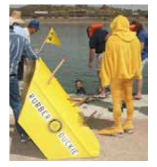
Join the Fun... Build a Boat or Clap & Cheer

Friday, July 26 6-7pm Greenwood Pool details p.7