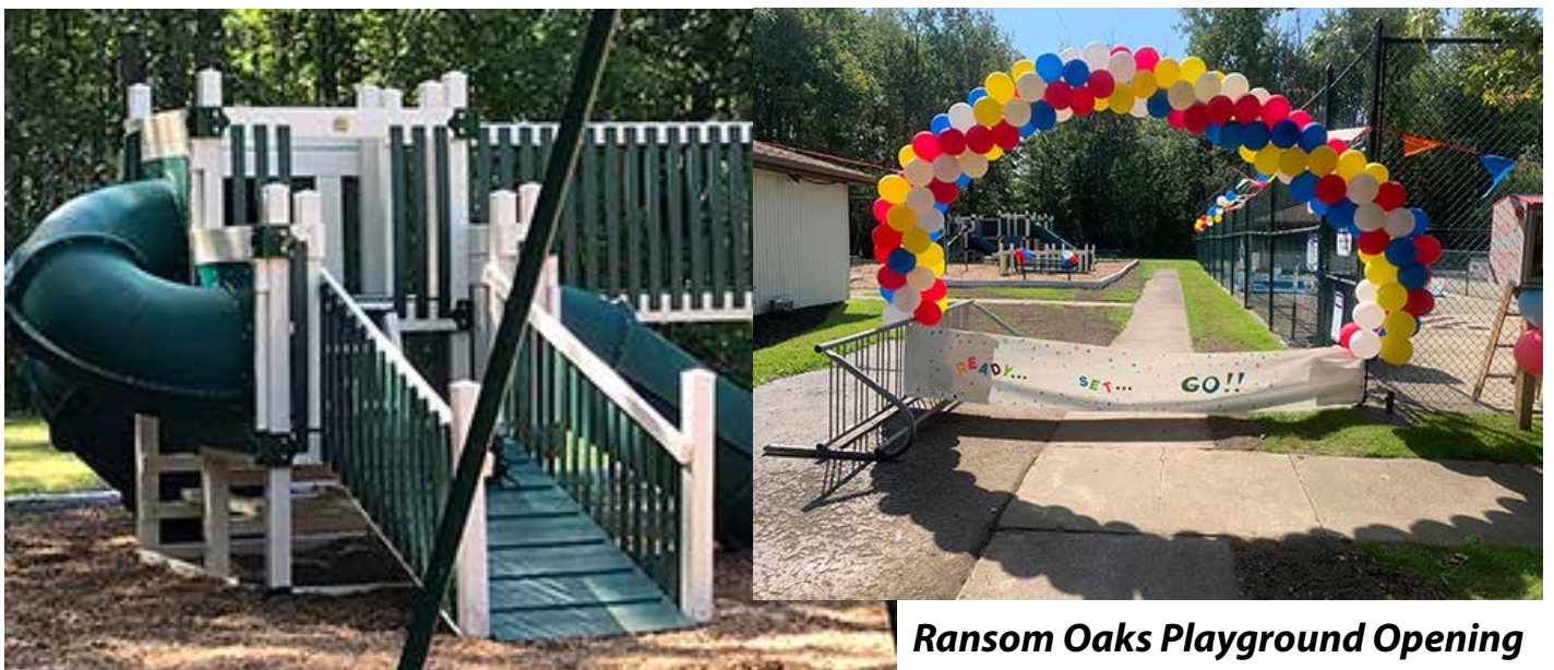
Ransom Oaks Playground Opening