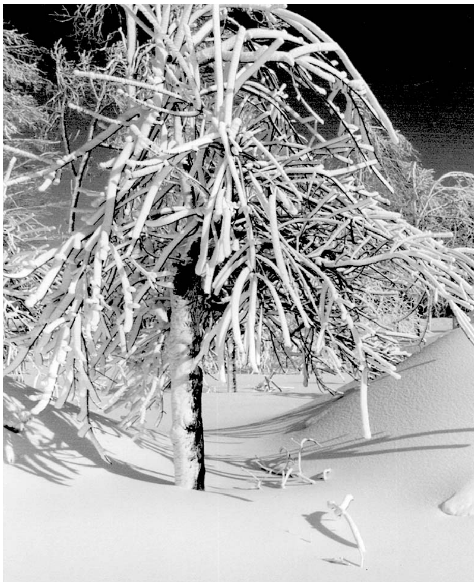
Winter at Niagara Falls