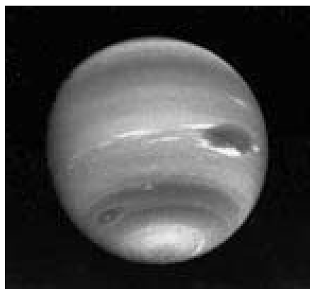
The planet Neptune.

Read about the history of The Riviera Theatre and Its Mighty Wurlitzer Pipe Organ at www.rivieratheatre.org !