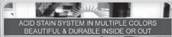
ACID STAIN SYSTEM IN MULTIPLE COLORS BEAUTIFUL & DURABLE INSIDE OR OUT