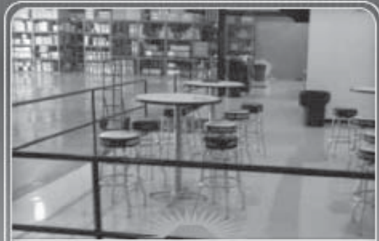
COMMERCIAL EPOXY SYSTEM