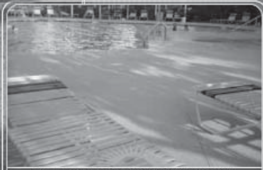
FOUR STEP, NON-SKID POOL SYSTEM