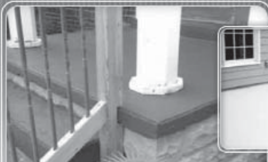
THREE STEP COLOR CONCRETE COATING