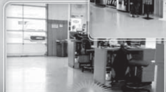
OUR FIVE STEP EPOXY SYSTEM IS STRONG ENOUGH FOR THIS CAR DEALERSHIP. IT WILL DO WONDERS FOR YOU!