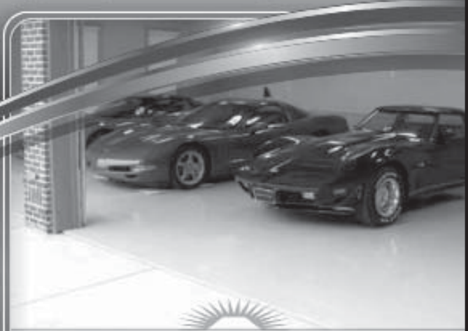
FIVE STEP, EPOXY GARAGE SYSTEM