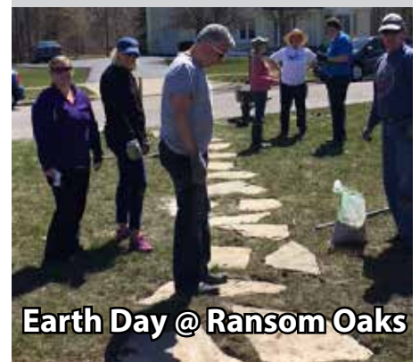
Earth Day @ Ransom Oaks