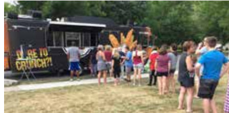
Food Truck Visits Ransom Oaks